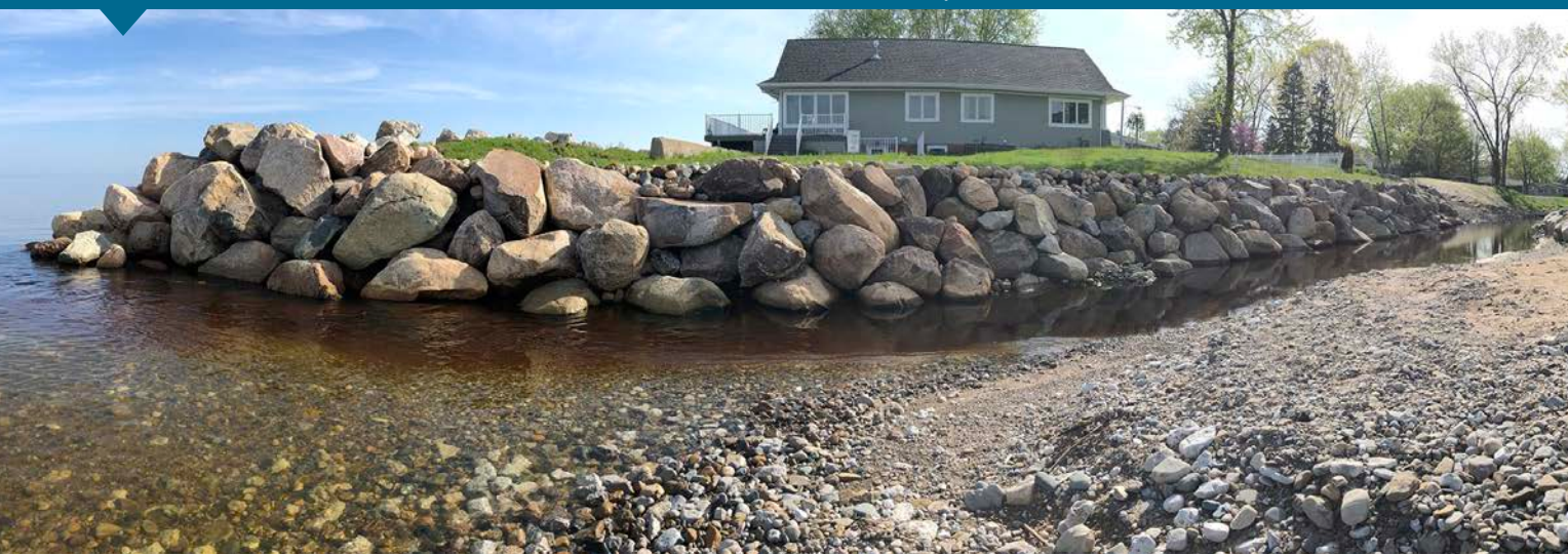
850 tons of boulders installed to protect the outlet.

The team also found that water was moving downstream too fast, and there was a major constriction at the culvert area under Water Street. Additionally, the creek's channel downstream from the culvert was eroding severely and impeding the flow of the creek.